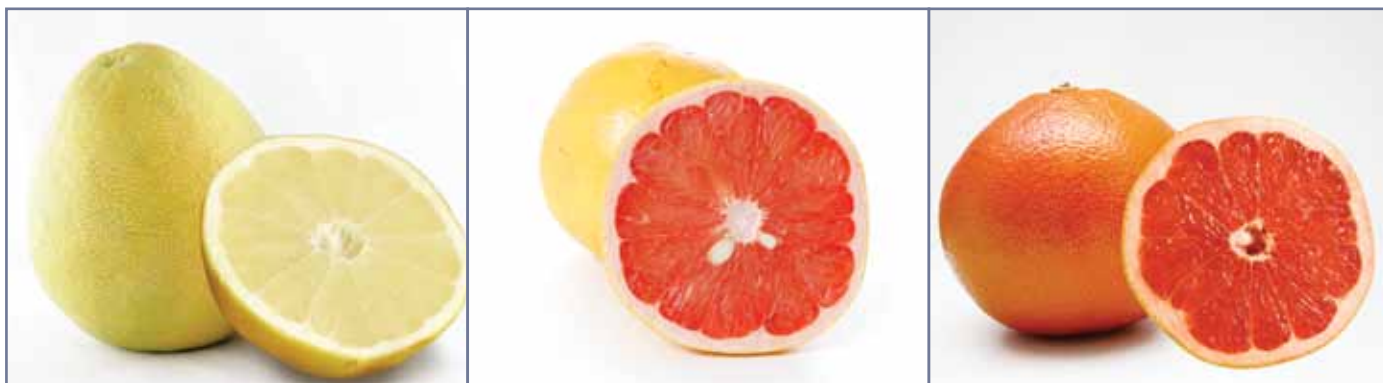
Figure 2: White, pink and ruby red grapefruit

Widely available, grapefruit and grapefruit juice are consumed by many individuals for fibre, vitamin C, antioxidants, and phytochemicals, to help meet daily nutritional requirements. Grapefruit is endorsed by the American Heart Association as a "heart-healthy food" because it contains compounds that may reduce the formation of atherosclerotic plaques. 3,4 It may also inhibit cancer cell proliferation. 5,6