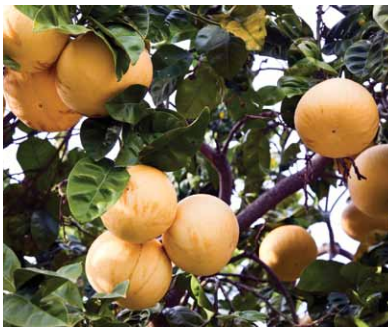
Figure 1: Grapefruits growing in a cluster on the tree

Grapefruit are believed to have evolved from the pummelo or pomelo ( C. maxima ), a citrus fruit from the Rutaceae (orange) family, through mutation or as a hybrid with the common orange ( C. sinensis ). The grapefruit is larger than an orange but smaller than most pummelos and can yield approximately 160 ml (2/3 cup) of juice. There are seedless and seeded varieties. The flesh comes in three colours, namely white, pink, and ruby red (Figure 2). 2